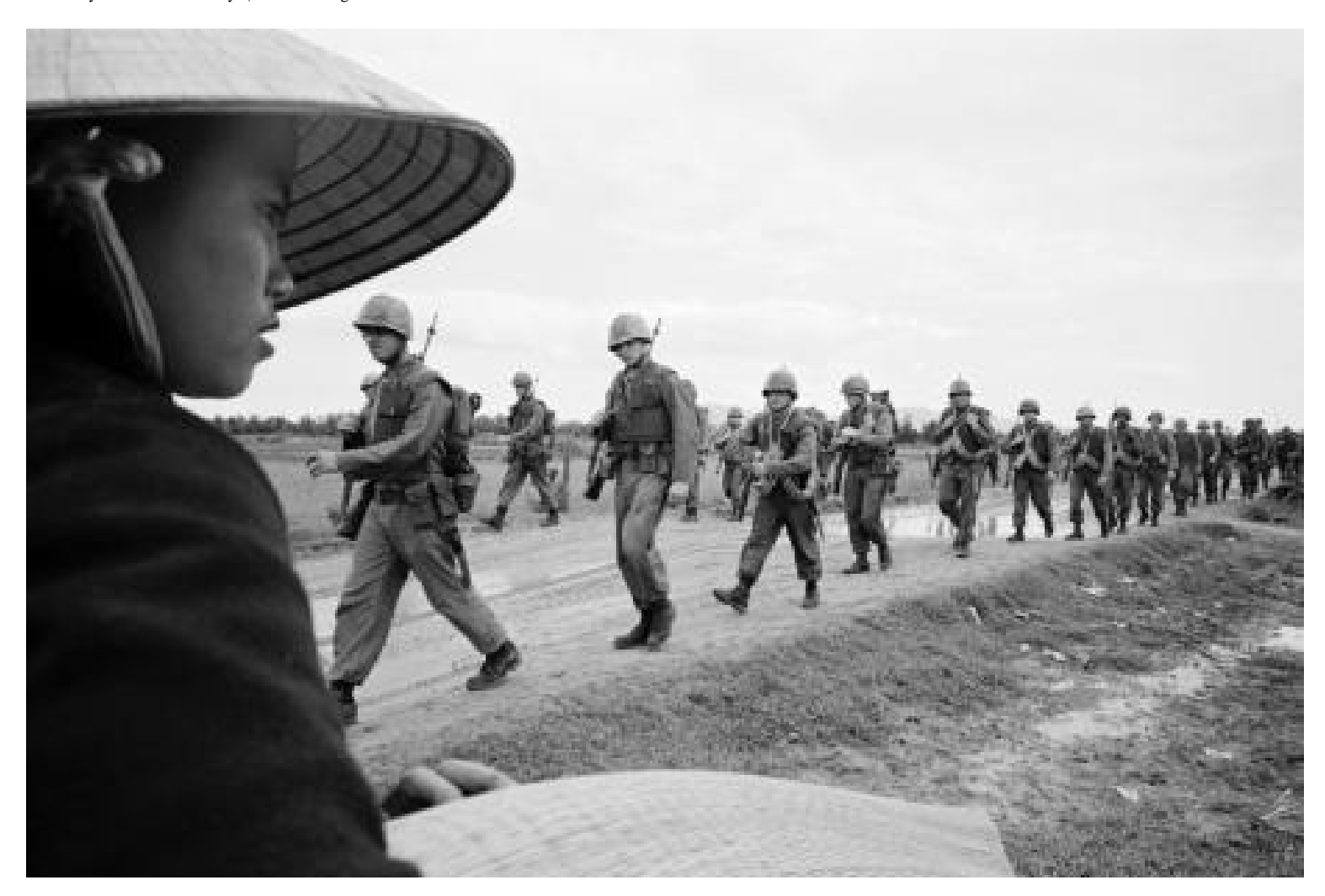
Ken Burns's 'Vietnam' Revisits A Barbaric War And Asks, What Went Wrong?

For nearly 20 years, the United States was severely divided by race, and a generational split not seen since the Civil War.