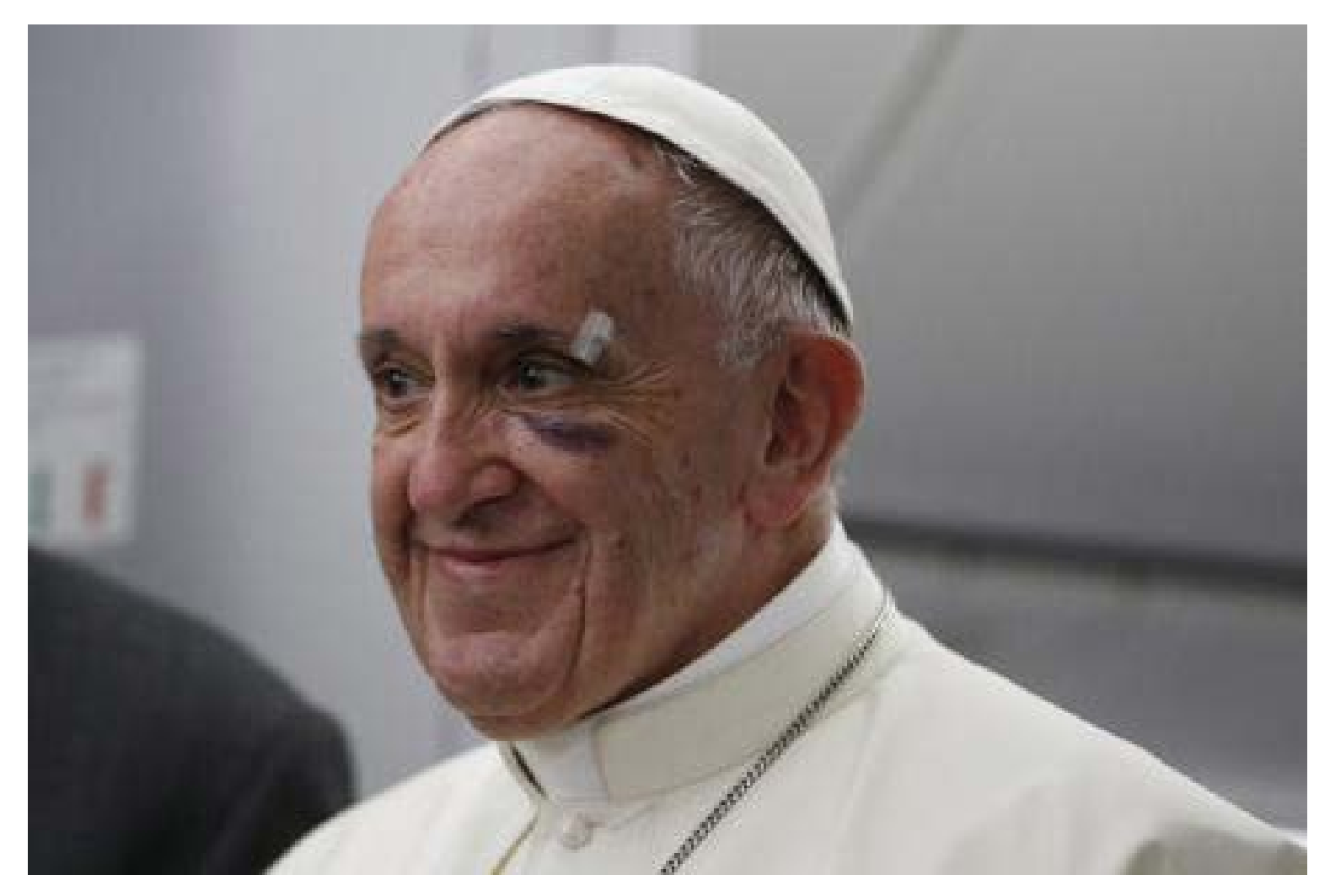
Pope Francis' Black Eye Tells Us A Lot About The Church Today

Francis' black eye provides a powerful metaphor for his ecclesial and personal style.