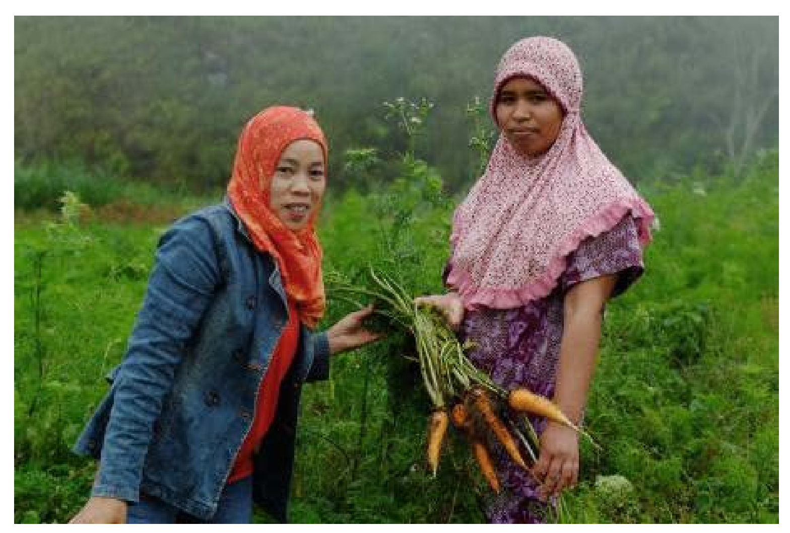
Canadian Catholic Bishops Celebrate 50 Years Of Development And Peace Agency